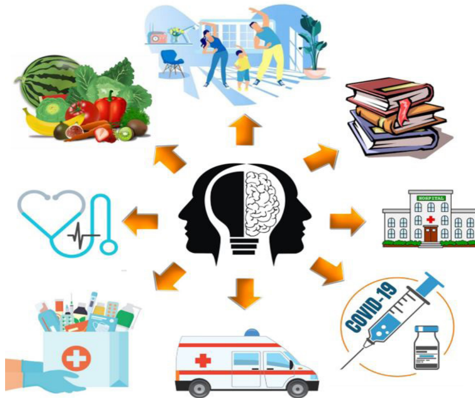
Figure 1: Graphical Abstract Health Literacy.

Citation: Abdul Kader M. Health Literacy: The Most Neglected Essential Human Quality. J Clin Med Img Case Rep. 2023; 3(2): 1399.