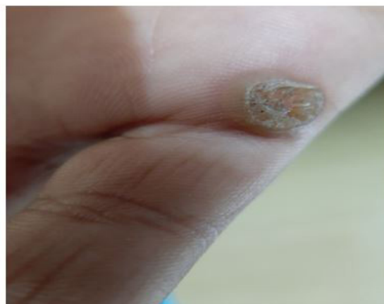
(B) After treatment