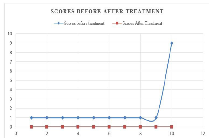
Graph: Graph showing scores before and after treatment.