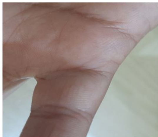
Figure 1: 9 years old boy hand's warts